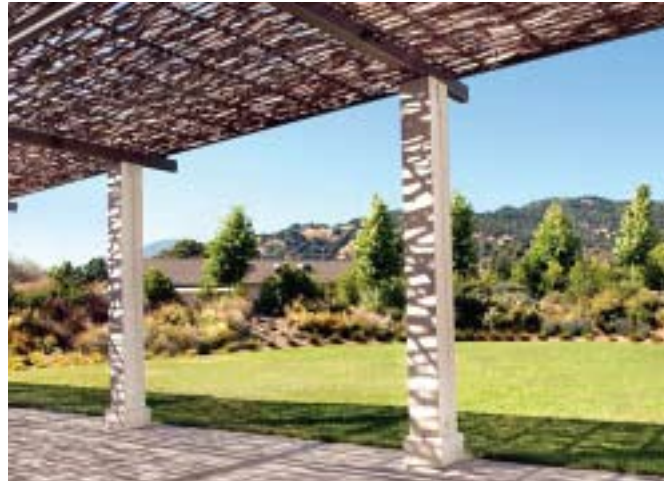
Solage Calistoga in Nappa Valley

Our mission is to strengthen veterinary-client-patient communication and support relationships between people and their companion animals.