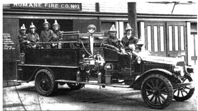
The Humane Fire Co. No. 1 in Bordentown, N.J., was one of a number of fire companies using “humane” in its name. The volunteer fire company, whose origins date to 1767, came into being out of an 1858 reorganization of the Union Fire Company. Humane was the first to update their equipment when they purchased this Mack truck in 1916.

Other early American usages of “humane” were humanitarian in scope but with no reference to kindness toward animals. The word is commonly found in early calls for penal reform, such as advanced by William Penn who in 1681 created “a more humane house of correction based on labor,” and by Benjamin Franklin who in 1790 advocated for “humane treatment of inmates” in Philadelphia’s Walnut Street Jail by using solitary cells (Dickinson, 2008). “Humane Fire Companies” were established in Philadelphia, Easton and Norristown, Pa., and Bordentown, N.J., as early as 1797 (Underwood, n.d.; Burlington County Firemen’s Association, 1922).